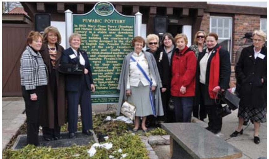
Above: Members of the Louisa St. Clair Chapter of the Daughters of the American Revolution